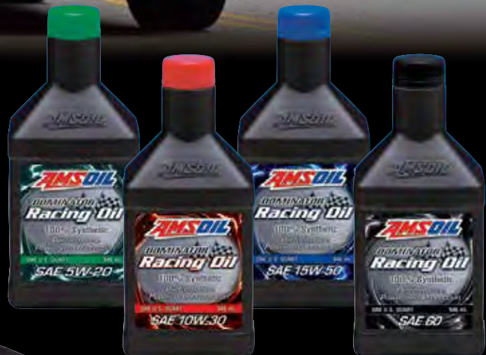
DOMINATOR® Synthetic Racing Oil