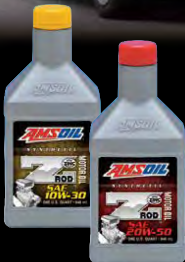
Z-ROD® Synthetic Motor Oil