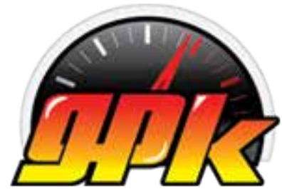
Ontario Z-Car Club Race League - Leader Board (as of April 19, 2017)