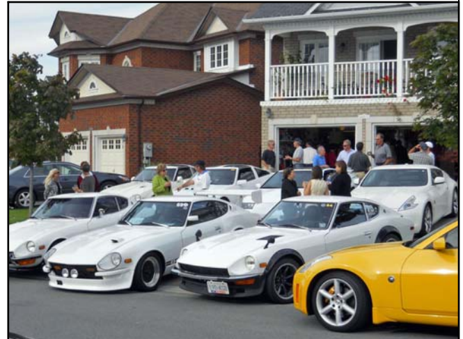
Another Road Tour