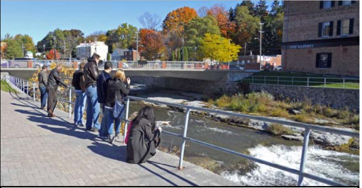
Checking out the salmon run on the Ganaraska River

Although a number of the trees were a bit bare, the Fall colours were still in abundance and with the sun out, we enjoyed a very leisurely drive, rather than a zoom, zoom one. We headed east on a road close to the lake, stopped for a picture session near a dock/pier and continued on to Port Hope. Walking around town for a bit, we ended up on a bridge overlooking the Ganaraska River. The salmon were making their spawning run and it was quite impressive to see them jumping up stream through the rapids.