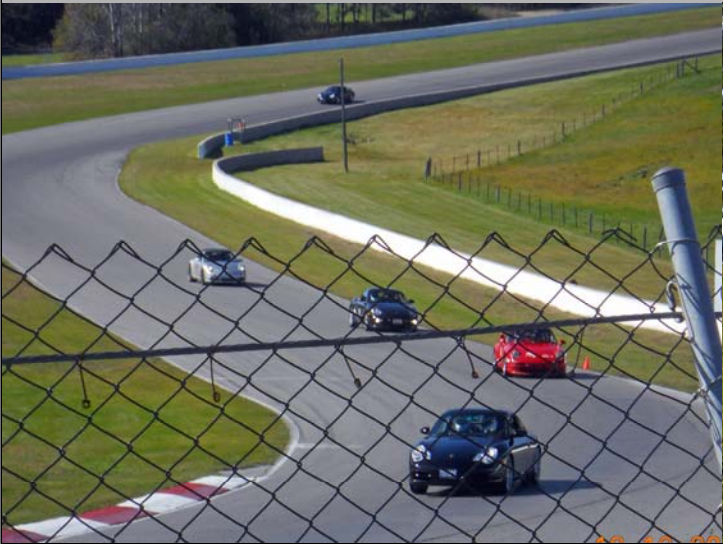
Watching the Porsche Club turning laps at Mosport