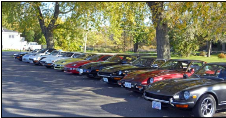
A Street Party

Here is what was happening with Ontario Z-Car as we closed 2010