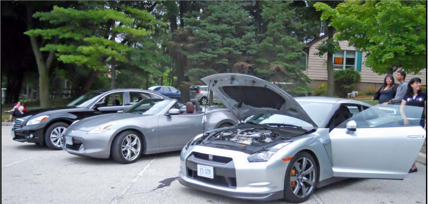
The Nissan Canada show cars