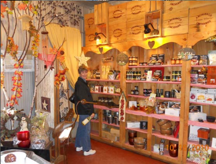
Below: A return visit to Archibald's Winery