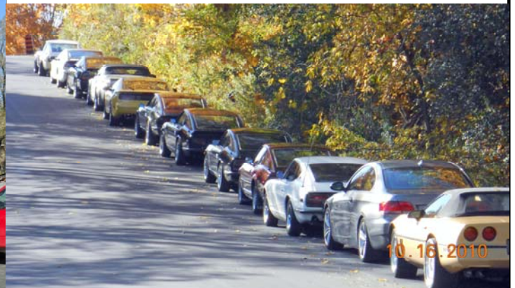
Left & Above: Just outside of Tyrone Mills Bakery