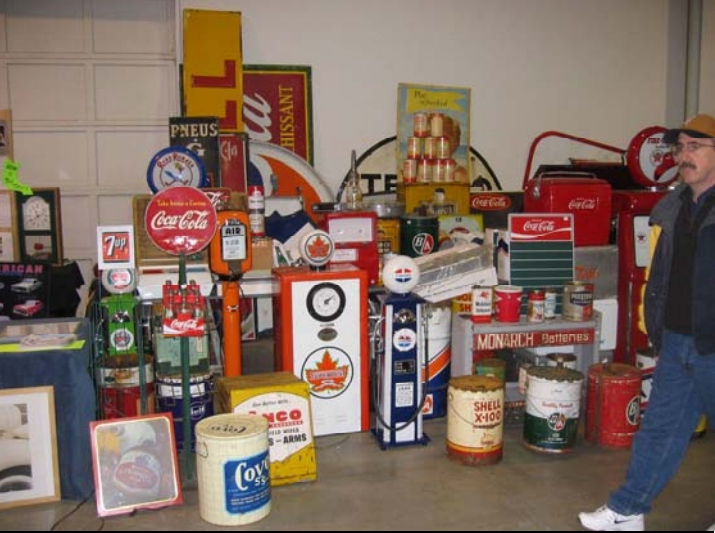
Lots of car memorabilia on sale too

tered and busy checking out some potential purchases! He said you have to know the market for what you are interested in buying as there are no guarantees or test drives as to the state of the cars and engines, just WSIWYG, what you see is what you get. Some have service records available and of course the cars are available for inspection in advance of their auction day. The seller can set a reserve price, meaning he/she doesn't have to let the car go if the bid price is lower than the reserve price set. There were lots of cars where the reserve price was waived by the owner during the auction process as they changed their minds rather than taking the car back home again.