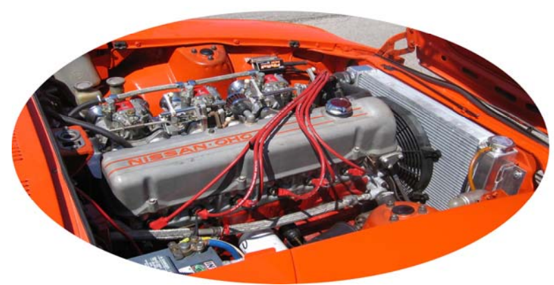
We are Your One Stop Solution for:

Prepared & Maintained by Whitehead Performance