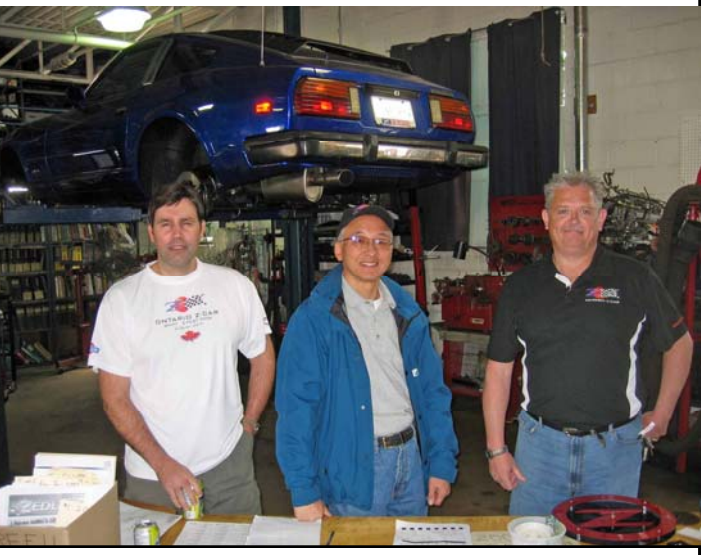
Working the OZC table, join the club, buy some club merchandise