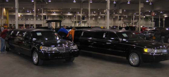
Anybody want to buy a limo instead?

up for sale. Prices were mainly under $100,000 dollars during our stay on Saturday and the highest bid price that I heard was $180,000 dollars for a 1969 Chevrolet Camaro COPO with a 427 in it. Most of the cars were North American manufactured with a few fancy imports thrown in. We even saw a 1982 280ZX in the auction, scheduled for the Sunday. It was a previous class winner at an old Z-Fest based on the display info inside the car. The audience numbers didn't seem that big as there was lots of seating room early on when the auction was underway but it soon