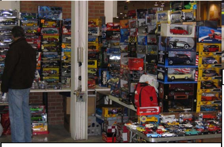
Anyone interested in die-cast miniatures?

The actual auction set up was quite impressive. There was a long raised platform to roll the cars upon for display during the bidding. Two big LCD TVs on both sides of the stage displayed the current bid price in Canadian dollars, US dollars and Euros but all bidding was conducted in Canadian dollars. There were spotters working the Bidders on the cars but it was very difficult to see who was actually