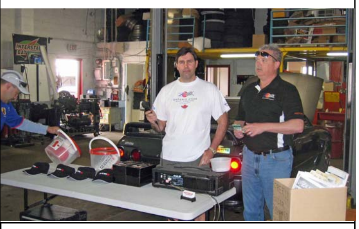
Prez, JP conducting the 50/50 draw with Terry's help