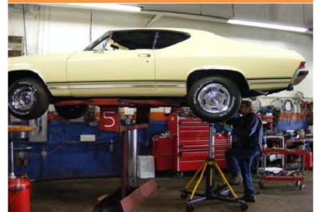
1970 Chev Chevelle Suspension Rebuild

Revitalizing Your Vintage Car's "Glory Day"