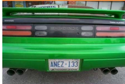
"The Green Machine" 1996 300ZXTT X Pipe Exhaust