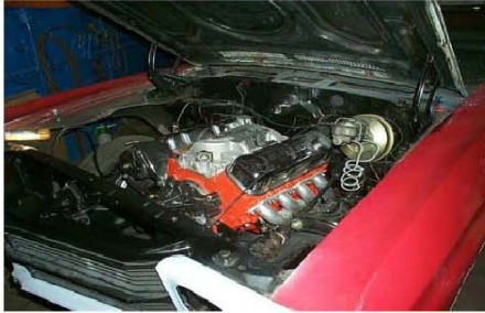
1970 Chev Chevelle Ceramic Headers