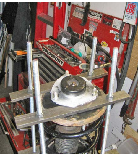
Compressor at work