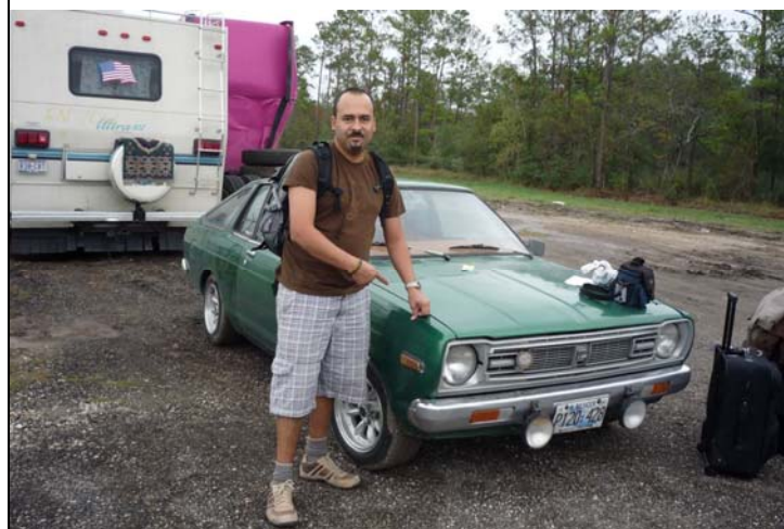
Are we there yet?

Day 3: Left the Big Easy, but not before giving the car a nice wash. We drove out of Louisiana through Mississippi and into Alabama. Problems started when the car started to sputter heavily. I thought it was bad gas so I stopped to get a bottle of good old carburetor