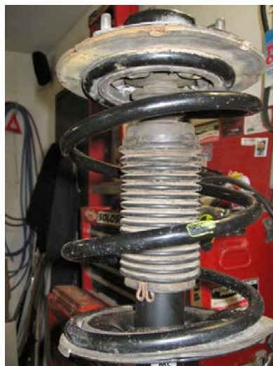
Ready to go