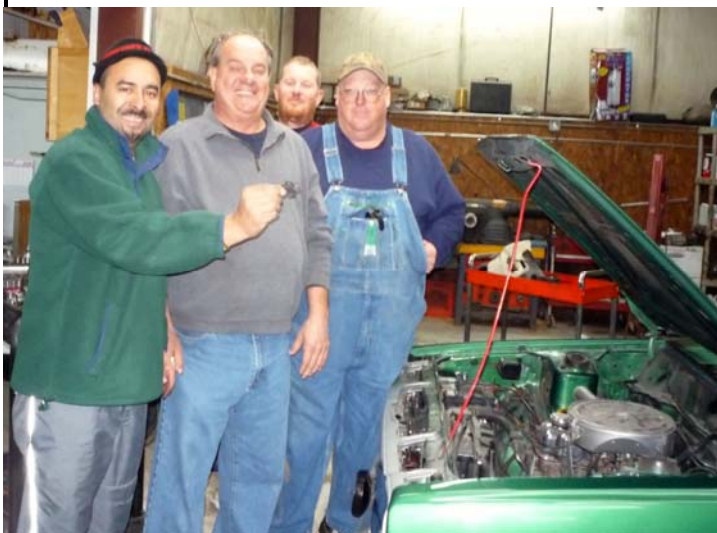
Thanks guys, couldn't have done it without you